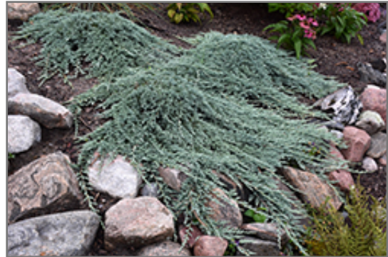
Icee Blue Juniper

Icee Blue Juniper will grow to be about 8 inches tall at maturity, with a spread of 6 feet. It tends to fill out right to the ground and therefore doesn't necessarily require facer plants in front. It grows at a slow rate, and under ideal conditions can be expected to live for approximately 30 years.