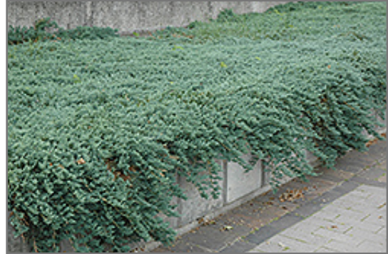
Icee Blue Juniper

Icee Blue Juniper is recommended for the following landscape applications;