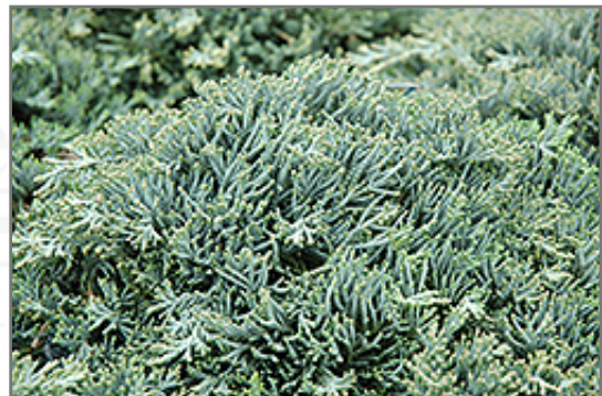
Icee Blue Juniper foliage