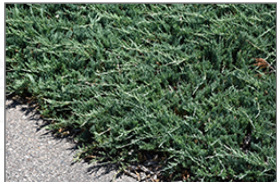
Bar Harbor Juniper