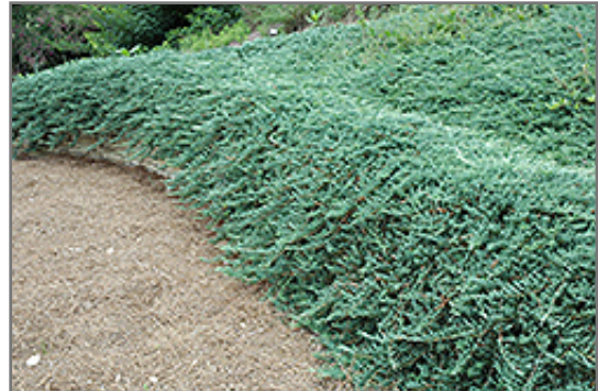
Bar Harbor Juniper

Bar Harbor Juniper is recommended for the following landscape applications;