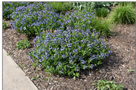
Blue Ice Star Flower in bloom