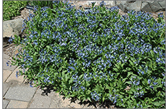
Blue Ice Star Flower in bloom

This plant does best in full sun to partial shade. It prefers to grow in average to moist conditions, and shouldn't be allowed to dry out. It is not particular as to soil type or pH. It is quite intolerant of urban pollution, therefore inner city or urban streetside plantings are best avoided. This is a selection of a native North American species. It can be propagated by cuttings; however, as a cultivated variety, be aware that it may be subject to certain restrictions or prohibitions on propagation.