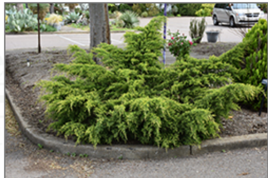
Gold Coast Juniper