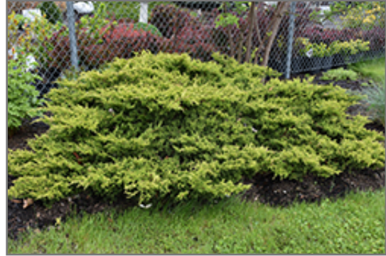
Gold Coast Juniper

Gold Coast Juniper is recommended for the following landscape applications;