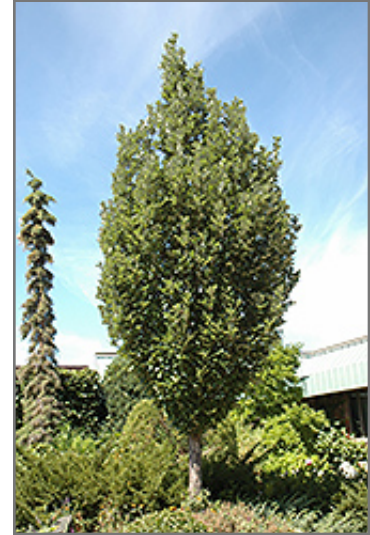
Crimson Spire Oak