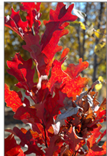
Crimson Spire Oak in fall