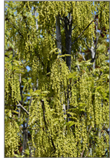
Crimson Spire Oak flowers

This tree should only be grown in full sunlight. It is very adaptable to both dry and moist locations, and should do just fine under average home landscape conditions. It is not particular as to soil type or pH. It is highly tolerant of urban pollution and will even thrive in inner city environments. This particular variety is an interspecific hybrid.