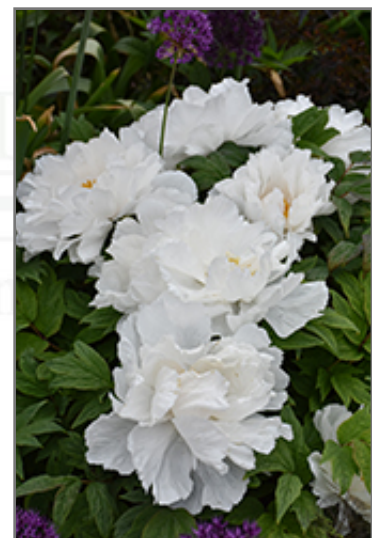
Renkaku Tree Peony flowers