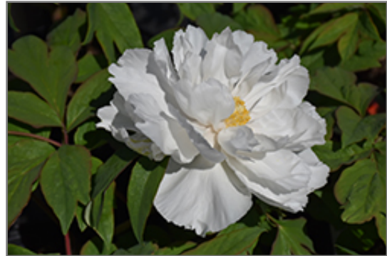
Renkaku Tree Peony flowers

Renkaku Tree Peony is recommended for the following landscape applications;