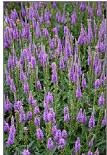
Purpleicious Speedwell flowers