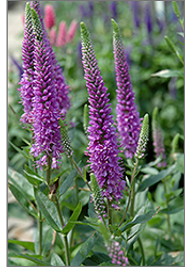
Purpleicious Speedwell flowers

Purpleicious Speedwell is a dense herbaceous perennial with an upright spreading habit of growth. Its medium texture blends into the garden, but can always be balanced by a couple of finer or coarser plants for an effective composition.