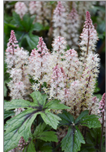
Pink Skyrocket Foamflower flowers

Pink Skyrocket Foamflower is an herbaceous evergreen perennial with tall flower stalks held atop a low mound of foliage. Its relatively fine texture sets it apart from other garden plants with less refined foliage.