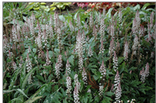
Pink Skyrocket Foamflower in bloom