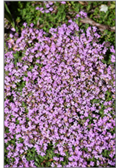
Elfin Creeping Thyme flowers

Elfin Creeping Thyme is a dense herbaceous evergreen perennial with a ground-hugging habit of growth. It brings an extremely fine and delicate texture to the garden composition and should be used to full effect.