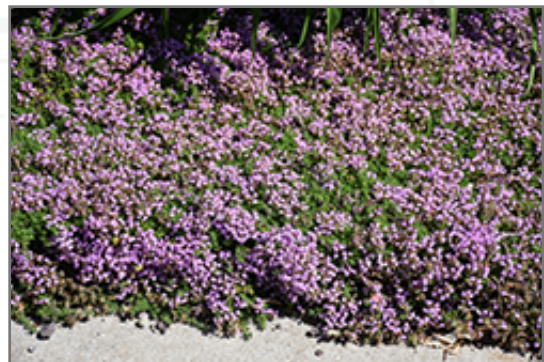
Elfin Creeping Thyme in bloom