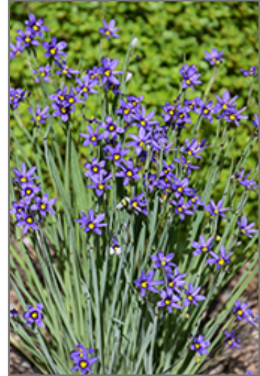
Narrowleaf Blue-Eyed Grass flowers

Narrowleaf Blue-Eyed Grass is an herbaceous perennial with an upright spreading habit of growth. Its medium texture blends into the garden, but can always be balanced by a couple of finer or coarser plants for an effective composition.