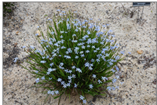
Narrowleaf Blue-Eyed Grass in bloom