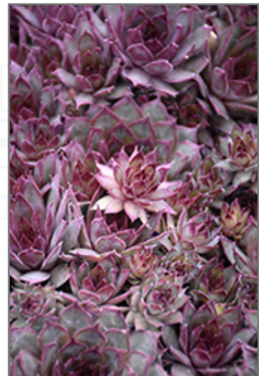
Red Beauty Hens And Chicks foliage