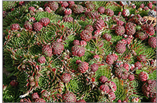
Red Beauty Hens And Chicks

Red Beauty Hens And Chicks is a dense herbaceous perennial with tall flower stalks held atop a low mound of foliage. Its relatively fine texture sets it apart from other garden plants with less refined foliage.