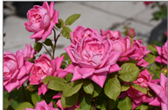
Pink Double Knock Out Rose flowers