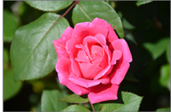
Pink Double Knock Out Rose flowers

Pink Double Knock Out Rose is a multi-stemmed deciduous shrub with a more or less rounded form. Its average texture blends into the landscape, but can be balanced by one or two finer or coarser trees or shrubs for an effective composition.