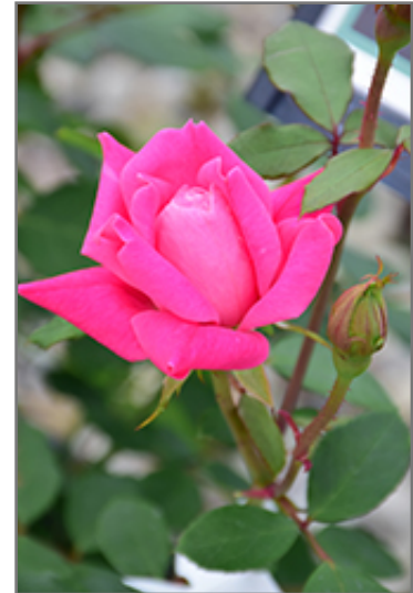
Pink Double Knock Out Rose flowers

This shrub should only be grown in full sunlight. It does best in average to evenly moist conditions, but will not tolerate standing water. It is not particular as to soil type or pH. It is somewhat tolerant of urban pollution. This particular variety is an interspecific hybrid.