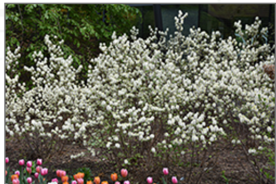
Mt. Airy Fothergilla in bloom