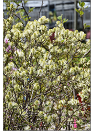
Mt. Airy Fothergilla flowers