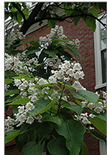
Northern Catalpa flowers