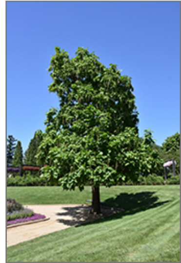
Northern Catalpa

This tree will require occasional maintenance and upkeep, and is best pruned in late winter once the threat of extreme cold has passed. It is a good choice for attracting hummingbirds to your yard, but is not particularly attractive to deer who tend to leave it alone in favor of tastier treats. Gardeners should be aware of the following characteristic(s) that may warrant special consideration;