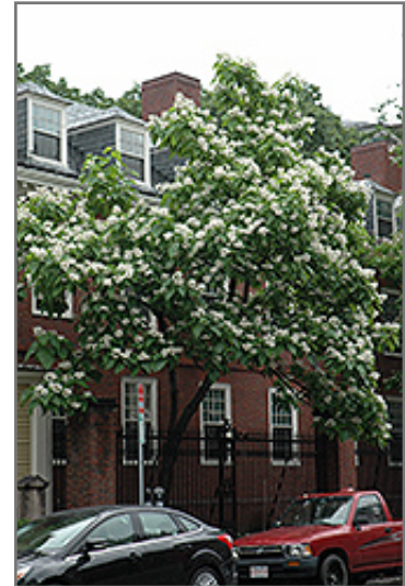
Northern Catalpa in bloom

This tree does best in full sun to partial shade. It is an amazingly adaptable plant, tolerating both dry conditions and even some standing water. It is considered to be drought-tolerant, and thus makes an ideal choice for xeriscaping or the moisture-conserving landscape. It is not particular as to soil type or pH, and is able to handle environmental salt. It is highly tolerant of urban pollution and will even thrive in inner city environments. This species is native to parts of North America.