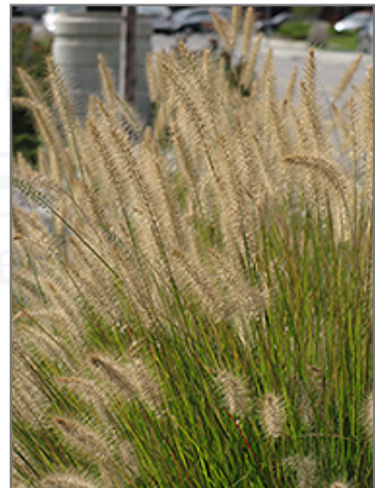
Hameln Dwarf Fountain Grass flowers