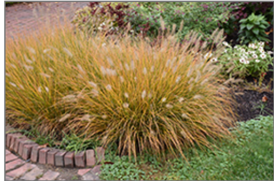
Hamel Dwarf Fountain Grass in fall

Hamel Dwarf Fountain Grass is a fine choice for the garden, but it is also a good selection for planting in outdoor pots and containers. It can be used either as 'filler' or as a 'thriller' in the 'spiller-thriller-filler' container combination, depending on the height and form of the other plants used in the container planting. It is even sizeable enough that it can be grown alone in a suitable container. Note that when growing plants in outdoor containers and baskets, they may require more frequent waterings than they would in the yard or garden. Be aware that in our climate, most plants cannot be expected to survive the winter if left in containers outdoors, and this plant is no exception. Contact our experts for more information on how to protect it over the winter months.