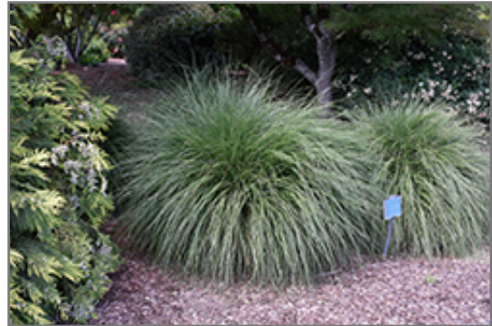
Hameln Dwarf Fountain Grass

This is a relatively low maintenance plant, and is best cleaned up in early spring before it resumes active growth for the season. Deer don't particularly care for this plant and will usually leave it alone in favor of tastier treats. It has no significant negative characteristics.