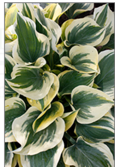
Liberty Hosta foliage