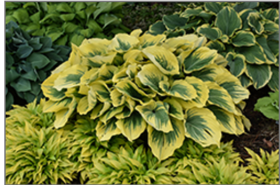
Liberty Hosta

This is a relatively low maintenance plant, and is best cleaned up in early spring before it resumes active growth for the season. Gardeners should be aware of the following characteristic(s) that may warrant special consideration;