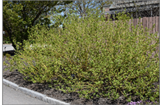
Budd's Yellow Dogwood in spring

This shrub does best in full sun to partial shade. It is an amazingly adaptable plant, tolerating both dry conditions and even some standing water. It is not particular as to soil type or pH. It is highly tolerant of urban pollution and will even thrive in inner city environments. This is a selected variety of a species not originally from North America.