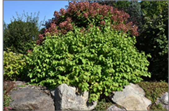
Budd's Yellow Dogwood

Budd's Yellow Dogwood is recommended for the following landscape applications;