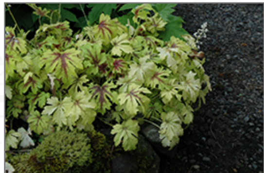
Golden Zebra Foamy Bells