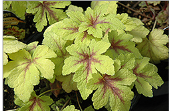
Golden Zebra Foamy Bells foliage

Golden Zebra Foamy Bells is recommended for the following landscape applications;