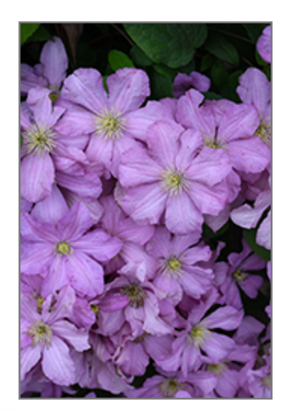
Comtesse de Bouchaud Clematis flowers

Comtesse de Bouchaud Clematis is recommended for the following landscape applications;