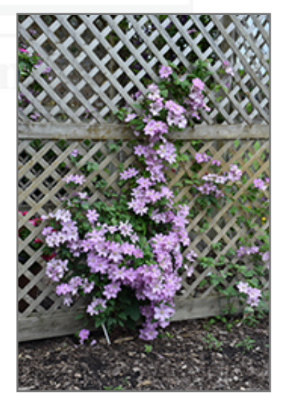
Comtesse de Bouchaud Clematis in bloom