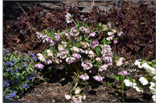
Peppermint Ice Hellebore in bloom