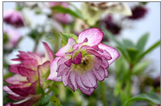
Peppermint Ice Hellebore flowers