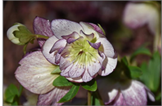
Peppermint Ice Hellebore flowers

Peppermint Ice Hellebore is an herbaceous evergreen perennial with an upright spreading habit of growth. Its medium texture blends into the garden, but can always be balanced by a couple of finer or coarser plants for an effective composition.