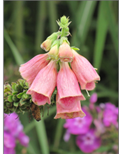
Strawberry Foxglove flowers

Strawberry Foxglove is an herbaceous perennial with a rigidly upright and towering form. Its medium texture blends into the garden, but can always be balanced by a couple of finer or coarser plants for an effective composition.