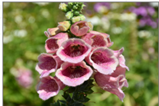
Strawberry Foxglove flowers