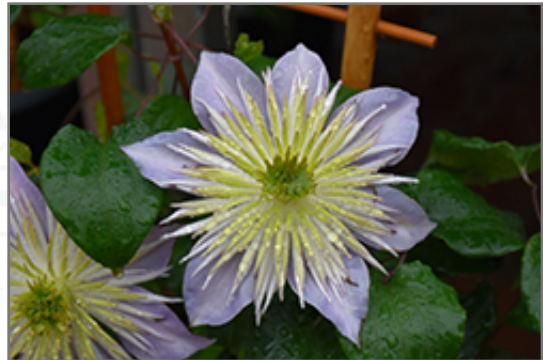
Crystal Fountain Clematis flowers