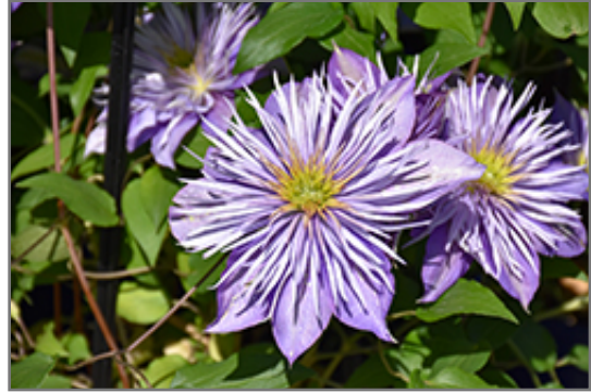
Crystal Fountain Clematis flowers

This is a relatively low maintenance woody vine. It is a Type 2 clematis, which means it will bloom primarily on old wood of the previous season, with a second flush later in summer. Dead and weak vines should be removed in late winter, and remaining vines should be trimmed back to the first buds that are seen to remove dead stems. It is a good choice for attracting bees and hummingbirds to your yard. It has no significant negative characteristics.