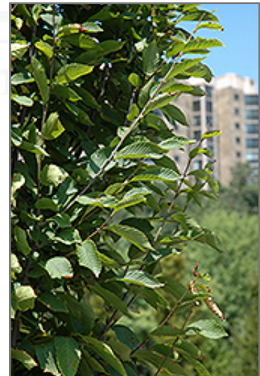
Frans Fontaine Hornbeam foliage