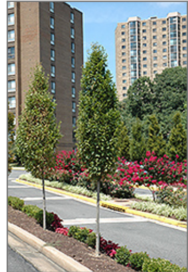
Frans Fontaine Hornbeam

This tree should only be grown in full sunlight. It prefers to grow in average to moist conditions, and shouldn't be allowed to dry out. It is not particular as to soil type or pH. It is highly tolerant of urban pollution and will even thrive in inner city environments. This is a selected variety of a species not originally from North America.