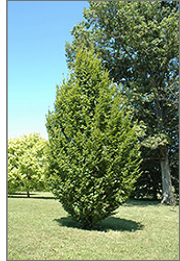
Frans Fontaine Hornbeam

Frans Fontaine Hornbeam is recommended for the following landscape applications;