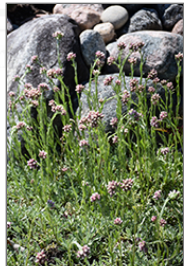
Red Pussytoes in bloom