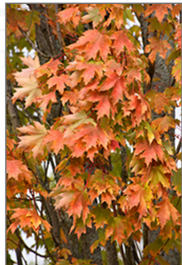
Armstrong Maple in fall