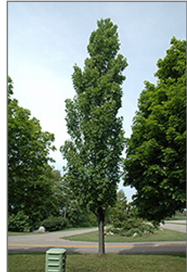
Armstrong Maple

Armstrong Maple is recommended for the following landscape applications;