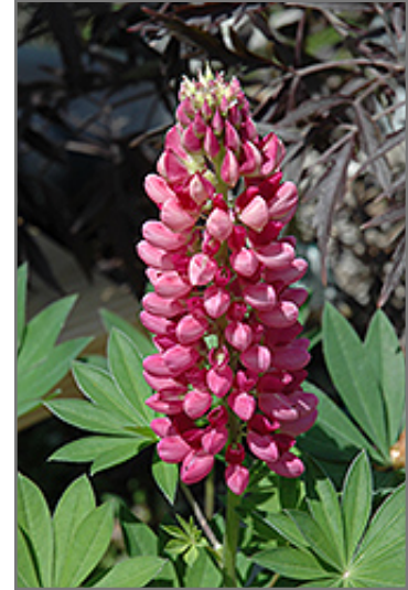
Gallery Red Lupine flowers

Gallery Red Lupine is recommended for the following landscape applications;