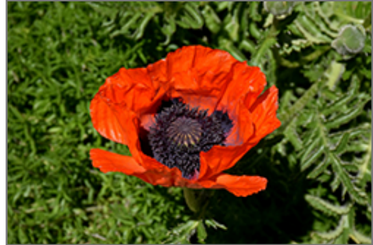
Beauty of Livermere Poppy flowers