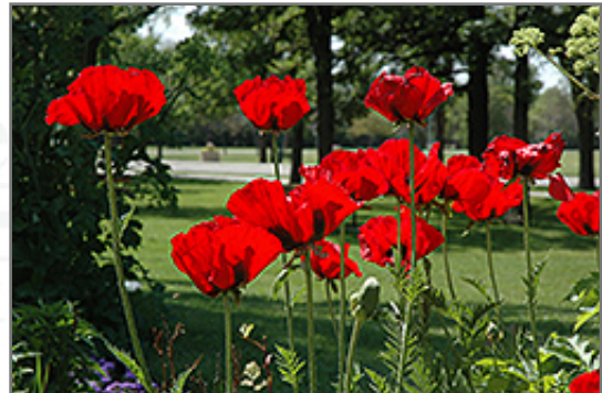
Beauty of Livermere Poppy flowers