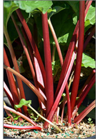
Canada Red Rhubarb fruit