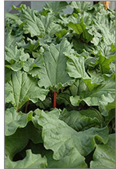
Canada Red Rhubarb

This plant is quite ornamental as well as edible, and is as much at home in a landscape or flower garden as it is in a designated edibles garden. It does best in full sun to partial shade. It is quite adaptable, preferring to grow in average to wet conditions, and will even tolerate some standing water. It is not particular as to soil type or pH. It is highly tolerant of urban pollution and will even thrive in inner city environments. This particular variety is an interspecific hybrid. It can be propagated by division; however, as a cultivated variety, be aware that it may be subject to certain restrictions or prohibitions on propagation.