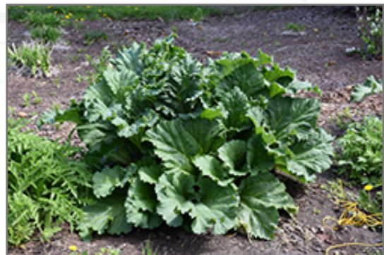
Canada Red Rhubarb