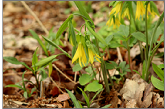
Great Merrybells flowers

Great Merrybells is recommended for the following landscape applications;