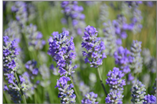
Munstead Lavender flowers

Munstead Lavender is recommended for the following landscape applications;