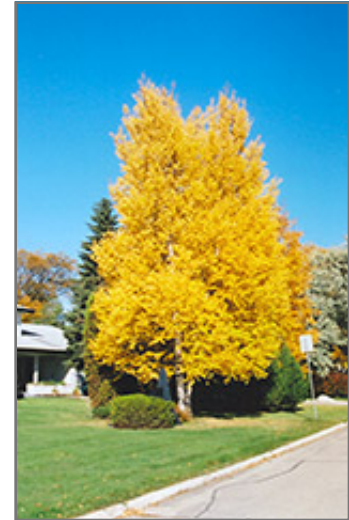
Paper Birch in fall

Paper Birch is recommended for the following landscape applications;