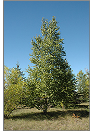
Paper Birch

This tree does best in full sun to partial shade. It prefers to grow in average to moist conditions, and shouldn't be allowed to dry out. It is not particular as to soil type or pH. It is somewhat tolerant of urban pollution. Consider applying a thick mulch around the root zone in winter to protect it in exposed locations or colder microclimates. This species is native to parts of North America.