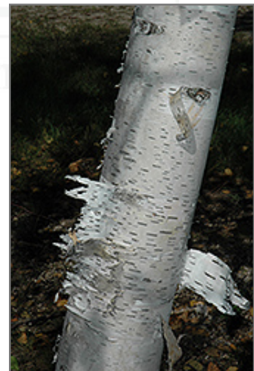
Paper Birch bark