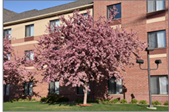
Robinson Flowering Crab in bloom

Robinson Flowering Crab is a deciduous tree with an upright spreading habit of growth. Its average texture blends into the landscape, but can be balanced by one or two finer or coarser trees or shrubs for an effective composition.