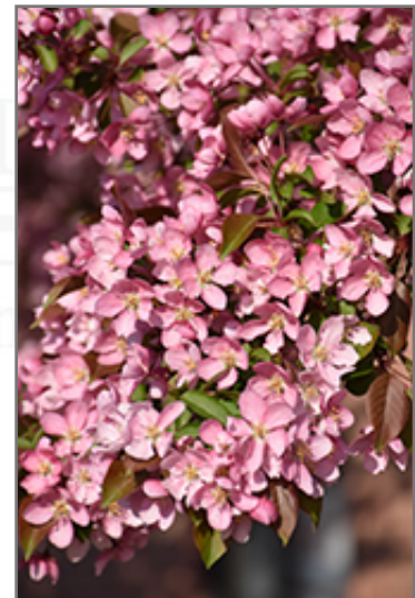
Robinson Flowering Crab flowers