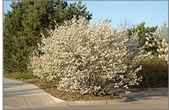
Shadblow Serviceberry in bloom

Shadblow Serviceberry is a multi-stemmed deciduous shrub with an upright spreading habit of growth. Its average texture blends into the landscape, but can be balanced by one or two finer or coarser trees or shrubs for an effective composition.