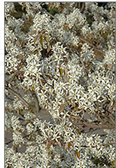
Shadblow Serviceberry flowers