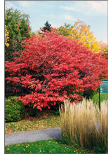
Shadblow Serviceberry in fall

This shrub does best in full sun to partial shade. It is quite adaptable, preferring to grow in average to wet conditions, and will even tolerate some standing water. It is not particular as to soil type or pH. It is somewhat tolerant of urban pollution. This species is native to parts of North America.