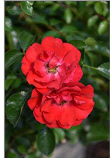
Flower Carpet Scarlet Rose flowers

Flower Carpet Scarlet Rose is recommended for the following landscape applications;