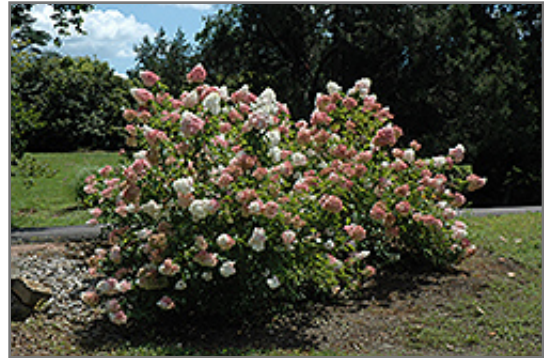
Vanilla Strawberry Hydrangea in bloom

Vanilla Strawberry Hydrangea is recommended for the following landscape applications;