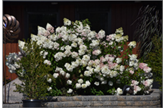
Vanilla Strawberry Hydrangea in bloom

This shrub performs well in both full sun and full shade. It prefers to grow in average to moist conditions, and shouldn't be allowed to dry out. It is not particular as to soil type or pH. It is highly tolerant of urban pollution and will even thrive in inner city environments. Consider applying a thick mulch around the root zone in winter to protect it in exposed locations or colder microclimates. This is a selected variety of a species not originally from North America.