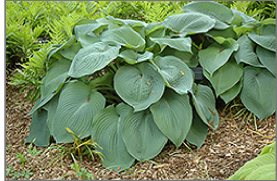
Big Daddy Hosta

Big Daddy Hosta will grow to be about 18 inches tall at maturity extending to 28 inches tall with the flowers, with a spread of 3 feet. When grown in masses or used as a bedding plant, individual plants should be spaced approximately 30 inches apart. Its foliage tends to remain dense right to the ground, not requiring facer plants in front. It grows at a medium rate, and under ideal conditions can be expected to live for approximately 10 years. As an herbaceous perennial, this plant will usually die back to the crown each winter, and will regrow from the base each spring. Be careful not to disturb the crown in late winter when it may not be readily seen!