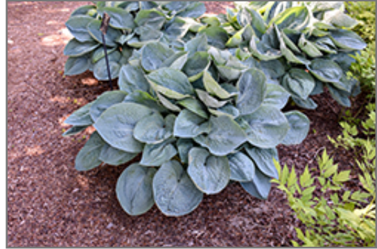
Big Daddy Hosta

This is a relatively low maintenance plant, and is best cleaned up in early spring before it resumes active growth for the season. Gardeners should be aware of the following characteristic(s) that may warrant special consideration;