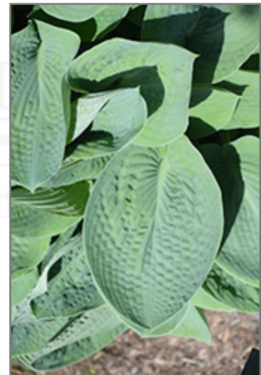
Big Daddy Hosta foliage