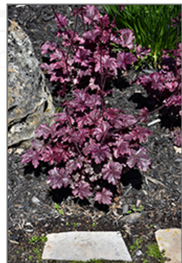
Midnight Rose Coral Bells