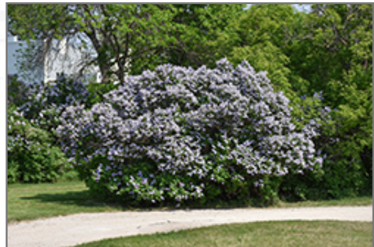
Common Lilac in bloom