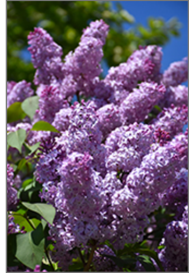
Common Lilac flowers

Common Lilac is a multi-stemmed deciduous shrub with an upright spreading habit of growth. Its relatively coarse texture can be used to stand it apart from other landscape plants with finer foliage.