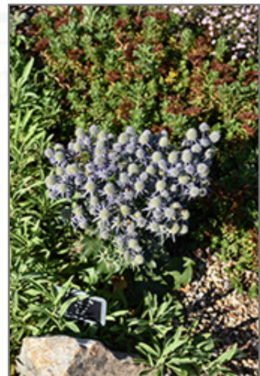
Blue Hobbit Sea Holly in bloom