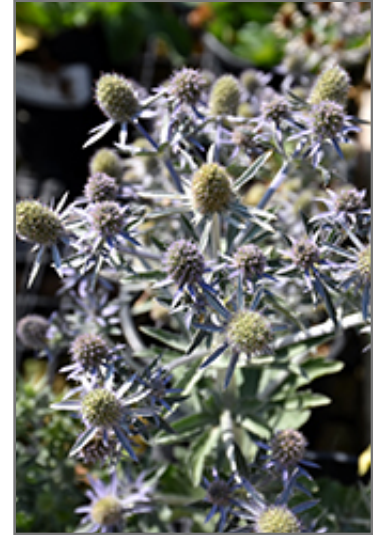
Blue Hobbit Sea Holly flowers

Blue Hobbit Sea Holly will grow to be about 12 inches tall at maturity extending to 18 inches tall with the flowers, with a spread of 12 inches. When grown in masses or used as a bedding plant, individual plants should be spaced approximately 10 inches apart. Its foliage tends to remain dense right to the ground, not requiring facer plants in front. It grows at a medium rate, and under ideal conditions can be expected to live for approximately 10 years. As an herbaceous perennial, this plant will usually die back to the crown each winter, and will regrow from the base each spring. Be careful not to disturb the crown in late winter when it may not be readily seen!