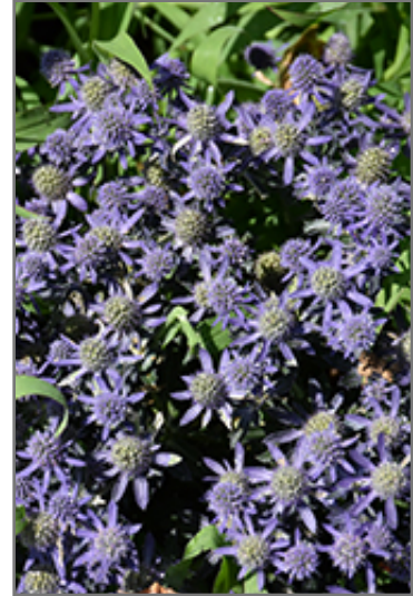
Blue Hobbit Sea Holly flowers

This plant will require occasional maintenance and upkeep, and is best cleaned up in early spring before it resumes active growth for the season. It is a good choice for attracting butterflies to your yard. Gardeners should be aware of the following characteristic(s) that may warrant special consideration;