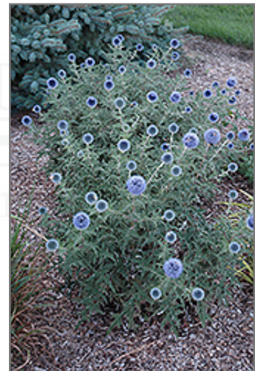
Blue Glow Globe Thistle in bloom