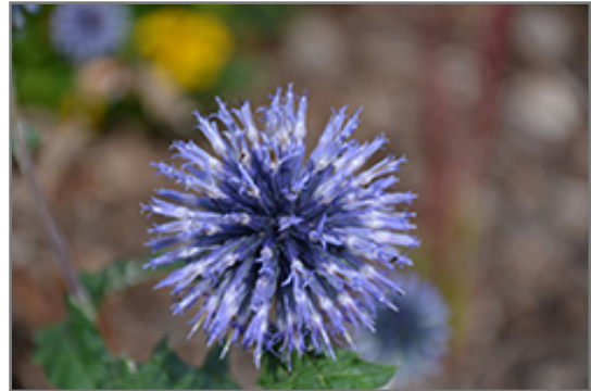
Blue Glow Globe Thistle flowers