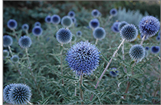
Blue Glow Globe Thistle flowers

Blue Glow Globe Thistle is an herbaceous perennial with an upright spreading habit of growth. Its relatively coarse texture can be used to stand it apart from other garden plants with finer foliage.