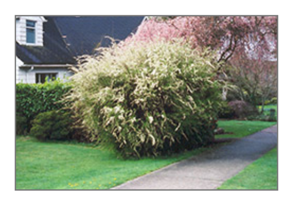
Garland Spirea in bloom

A magnificent sight in spring with arching branches draped in snow-white flowers; a medium-sized shrub with small foliage, keeps tidy the rest of the year, low maintenance; ideal as a specimen or in a large shrub border; full sun and well-drained soil