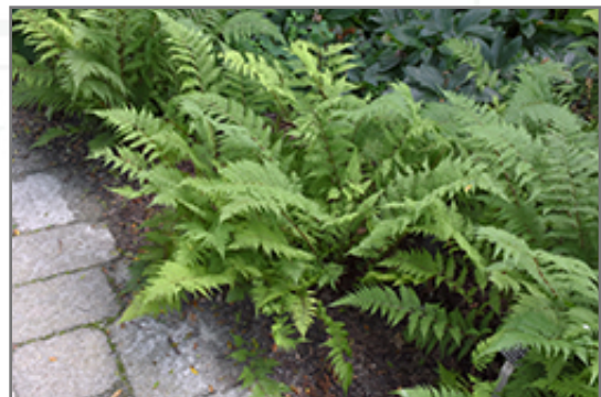
Lady in Red Fern