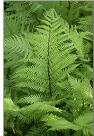
Lady in Red Fern foliage

Lady in Red Fern is recommended for the following landscape applications;