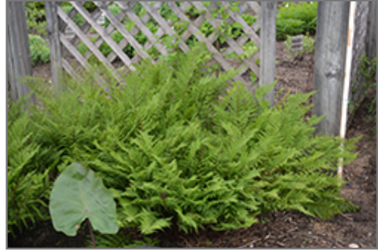
Lady in Red Fern

Lady in Red Fern will grow to be about 3 feet tall at maturity, with a spread of 24 inches. Its foliage tends to remain dense right to the ground, not requiring facer plants in front. It grows at a slow rate, and under ideal conditions can be expected to live for approximately 15 years. As an herbaceous perennial, this plant will usually die back to the crown each winter, and will regrow from the base each spring. Be careful not to disturb the crown in late winter when it may not be readily seen!