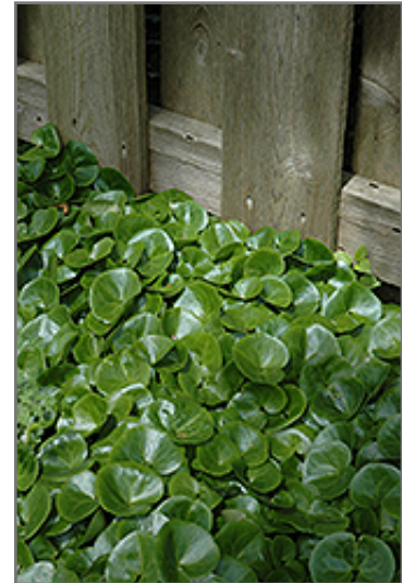
European Wild Ginger

European Wild Ginger is recommended for the following landscape applications;