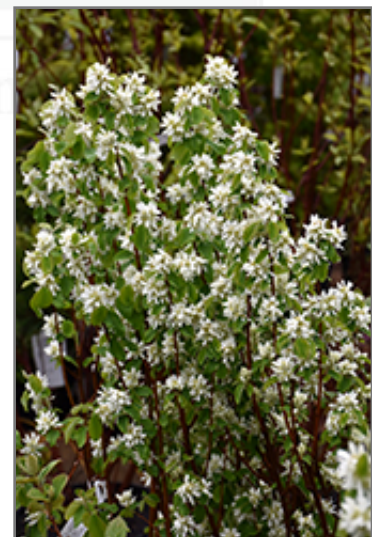
Standing Ovation Saskatoon Berry flowers