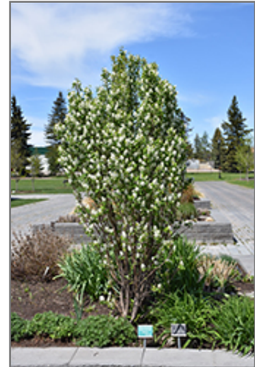
Standing Ovation Saskatoon Berry in bloom

Standing Ovation Saskatoon Berry is recommended for the following landscape applications;