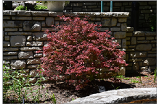
Shaina Japanese Maple

This is a relatively low maintenance tree, and should only be pruned in summer after the leaves have fully developed, as it may 'bleed' sap if pruned in late winter or early spring. It has no significant negative characteristics.