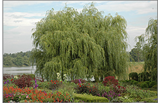
Golden Weeping Willow

This is a high maintenance tree that will require regular care and upkeep, and is best pruned in late winter once the threat of extreme cold has passed. Gardeners should be aware of the following characteristic(s) that may warrant special consideration;