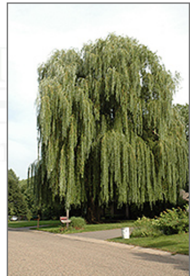
Golden Weeping Willow