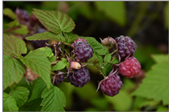
Jewel Black Raspberry fruit