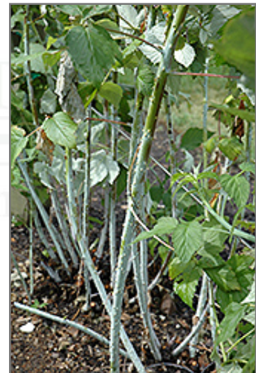
Jewel Black Raspberry bark