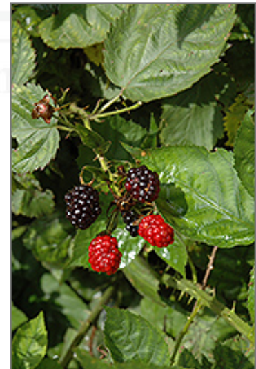
Illini Hardy Blackberry fruit