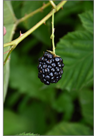
Illini Hardy Blackberry fruit

Illini Hardy Blackberry has rich green deciduous foliage on a plant with an upright spreading habit of growth. The fuzzy oval compound leaves do not develop any appreciable fall colour. It features an abundance of magnificent black berries in mid summer.