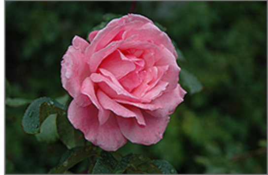
Queen Elizabeth Rose flowers

This is a high maintenance shrub that will require regular care and upkeep, and is best pruned in late winter once the threat of extreme cold has passed. Gardeners should be aware of the following characteristic(s) that may warrant special consideration;