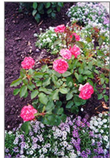
Queen Elizabeth Rose in bloom