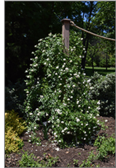
Iceberg Rose in bloom

This shrub should only be grown in full sunlight. It does best in average to evenly moist conditions, but will not tolerate standing water. It is not particular as to soil type or pH. It is highly tolerant of urban pollution and will even thrive in inner city environments. This particular variety is an interspecific hybrid.