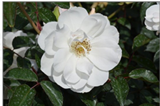
Iceberg Rose flowers