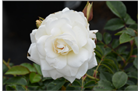
Iceberg Rose flowers

This shrub will require occasional maintenance and upkeep, and is best pruned in late winter once the threat of extreme cold has passed. Gardeners should be aware of the following characteristic(s) that may warrant special consideration;